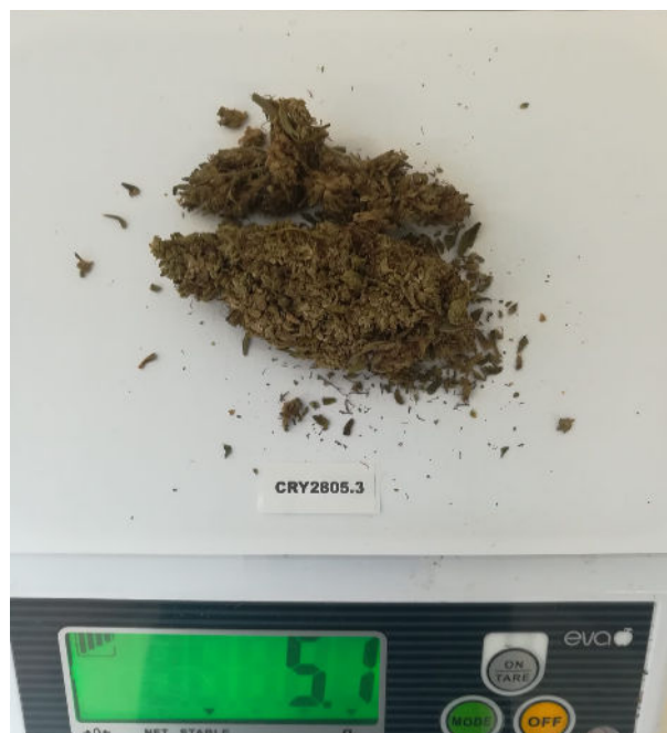
CAMPIONE ANALIZZATO: Eletta Campana(3.00gr)