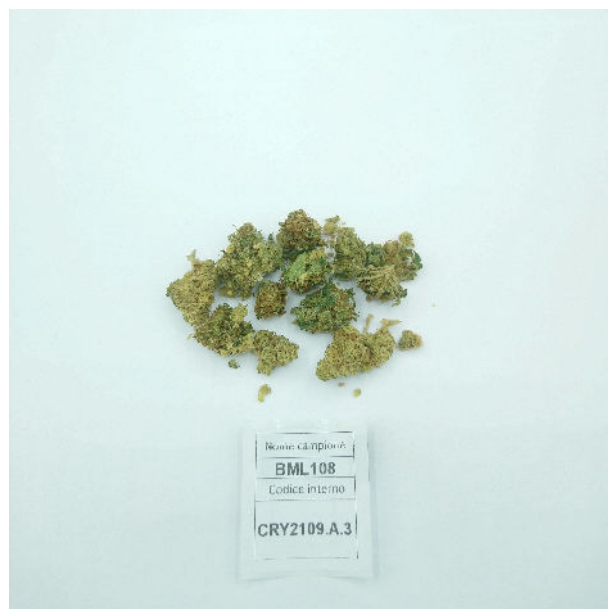
CAMPIONE ANALIZZATO: Fibranova(3.00gr)